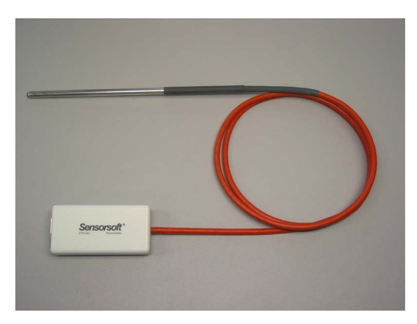
Figure 1: Photo of the ST6154J Sensorsoft Thermometer with stainless steel probe.

Only the probe portion of the ST6154J is suitable for exposure in the above listed environments. The plastic electronic housing must be protected from water, moisture, condensation and sunlight (UV).